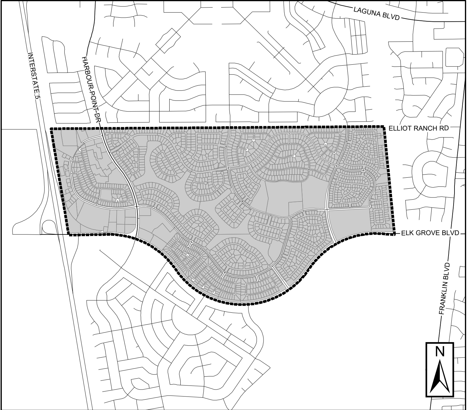
FIGURE A SACRAMENTO COUNTY LAGUNA CREEK RANCH/ELLIOTT RANCH COMMUNITY FACILITIES DISTRICT NO. 1 IMPROVEMENT AREA 2 - ELLIOT RANCH BOUNDARY & VICINITY MAP