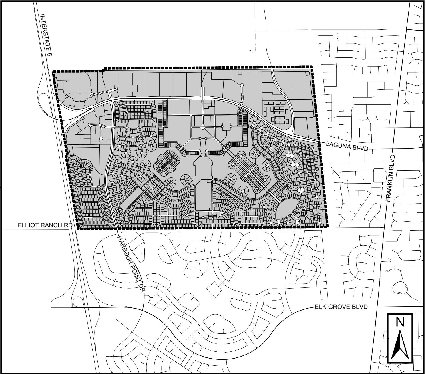
FIGURE A SACRAMENTO COUNTY LAGUNA CREEK RANCH/ELLIOTT RANCH COMMUNITY FACILITIES DISTRICT NO. 1 IMPROVEMENT AREA 1 - LAGUNA CREEK RANCH BOUNDARY & VICINITY MAP